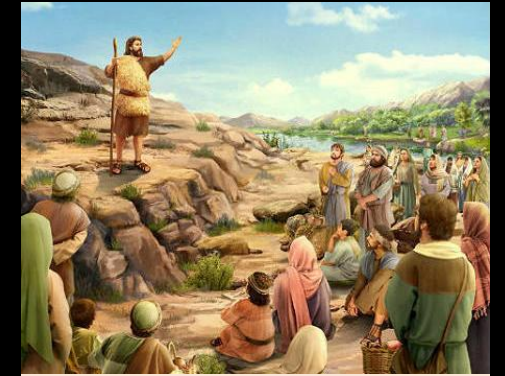
John the Baptist in the wilderness.